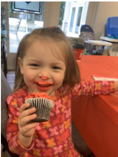
I love any icing that matches my dress