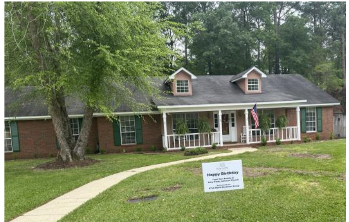
Tommie Ethington's birthday sign 04/09/24