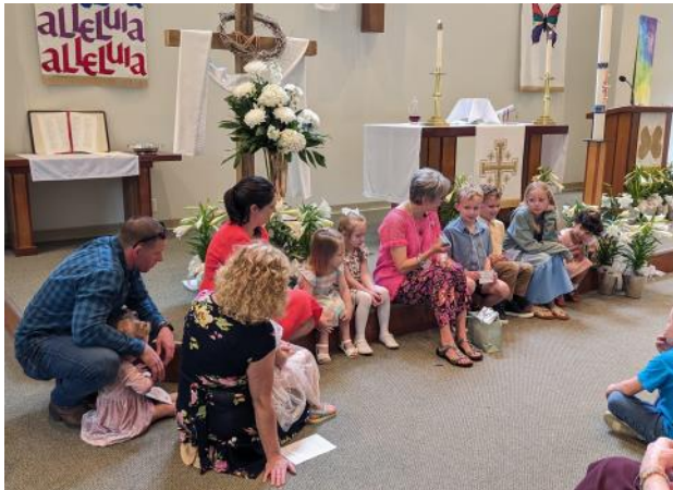
Easter's Children's sermon