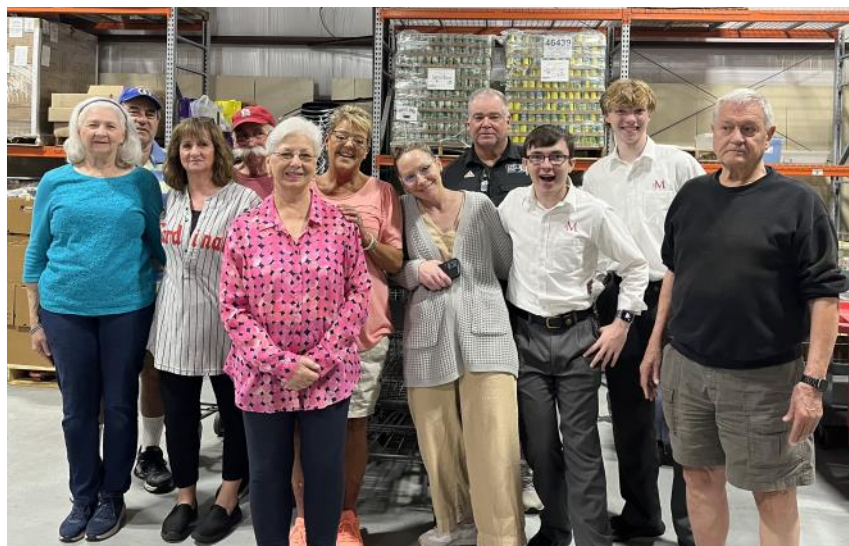
April's Prodissee Pantry Crew

Current vs. Building Fund Reminder: Specify how you want your offering split between the Current Fund and the Building Fund. If you do not specify on your envelope, it will by default go to the Current Fund. Anonymous cash (without an envelope specification) will all go towards the Current Fund. Checks without an envelope or notation on the check will by default go 100% towards the Current Fund. If you wonder about the percentage split that best services both funds, try directing 65% towards the Current Fund and 35% towards the Building Fund. Ongoing mission activities and Synod/ELCA funding is sourced from the Current Fund.