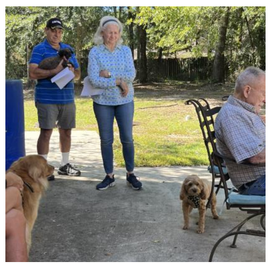
Remarkable harmony among all of the animals: horses, ponies, 2 legged ones and all of the four legged ones.