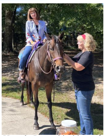
How do I turn this thing on?