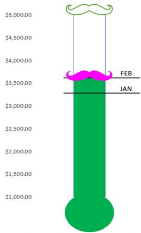
2024 WEEKLY GIVING

“Like good stewards of the manifold grace of God, serve one another with whatever gift each of you has received.” (I Peter 4:10)