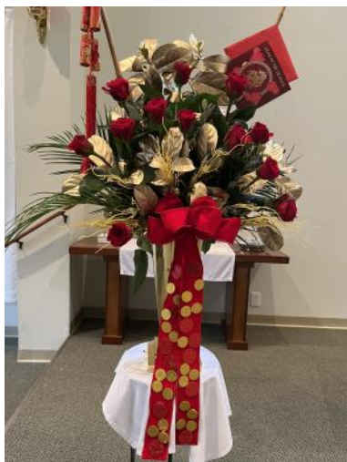
Flowers celebrating the Chinese New Year 2024