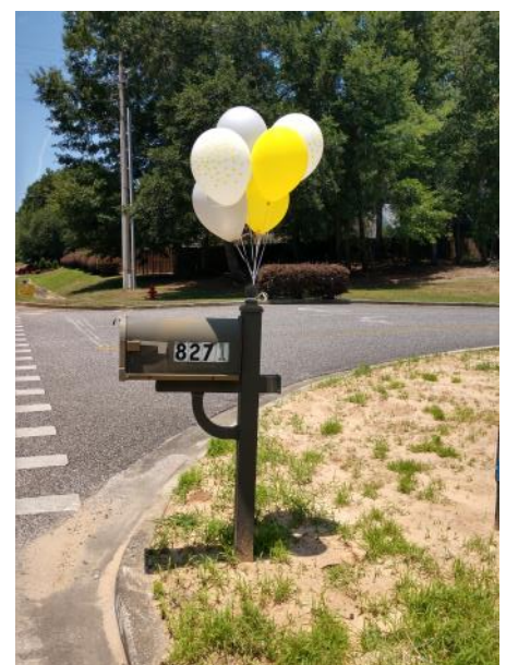
Free Lemonade Stand on a scorching, hot Saturday in June