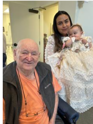
The young and the seasoned.