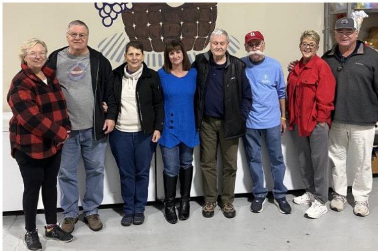
December's Prodissee Pantry Crew