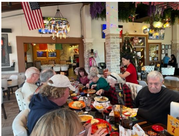
December's Lunch Bunch