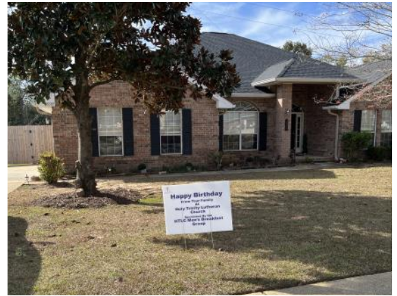
Gage Foxworth's birthday sign