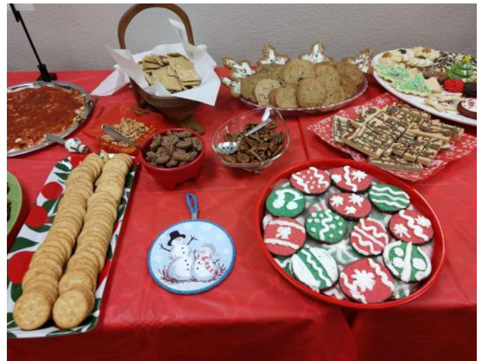
Women's Christmas Tea decorations and assorted goodies