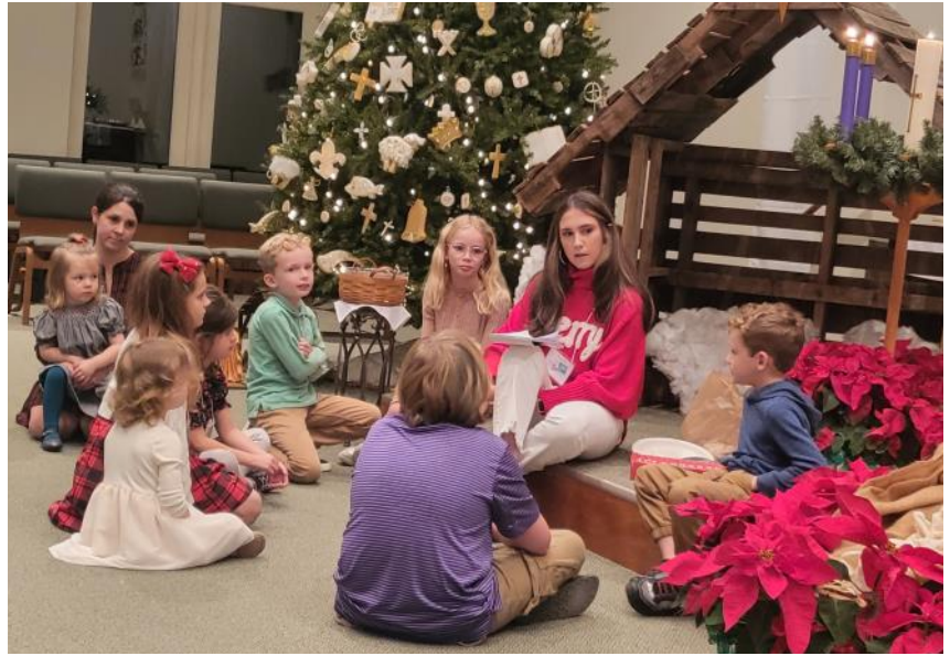
Children's sermon on Christmas Eve