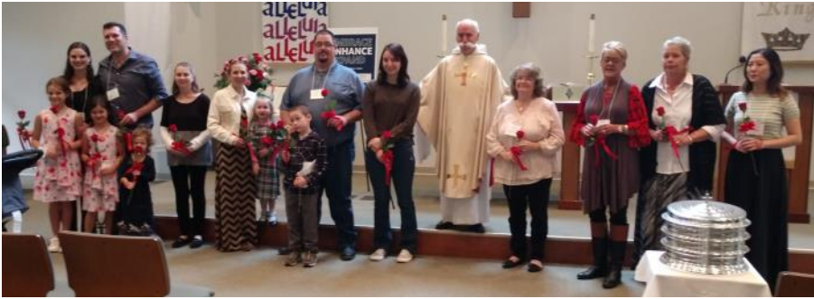
New Members November 26, 2023