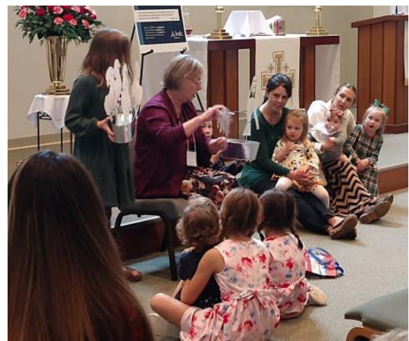
Another delightful children's sermon