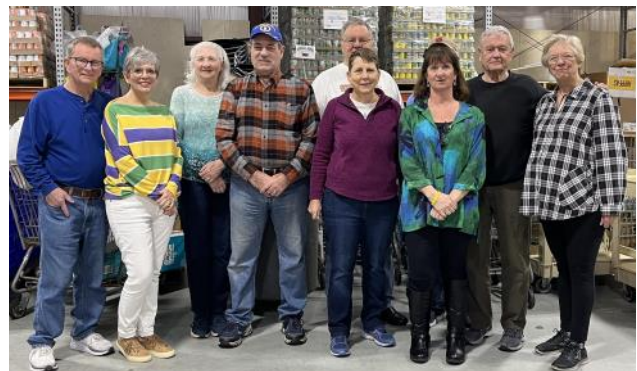
January's Prodissee Pantry Crew