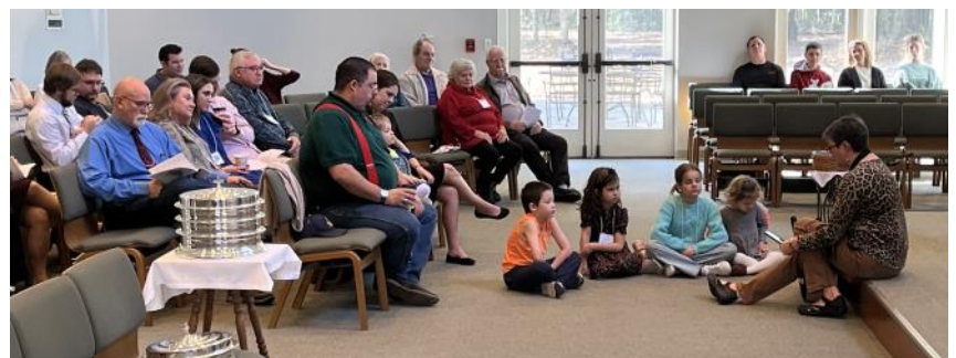
1/7/24 Children's Sermon