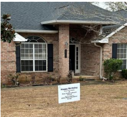
Jackie Foxworth received a birthday sign last month