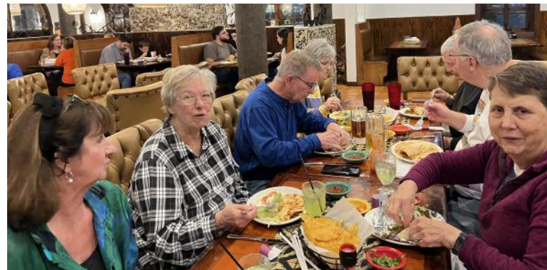
Fellowship and a Meal after Prodisee Pantry