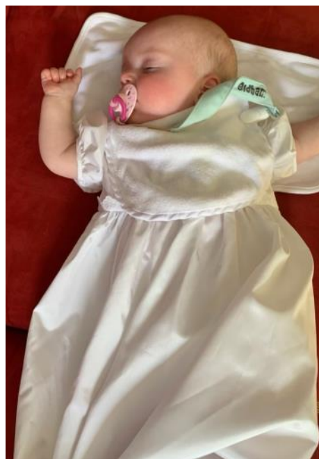
Grandma's wedding dress was re-purposed