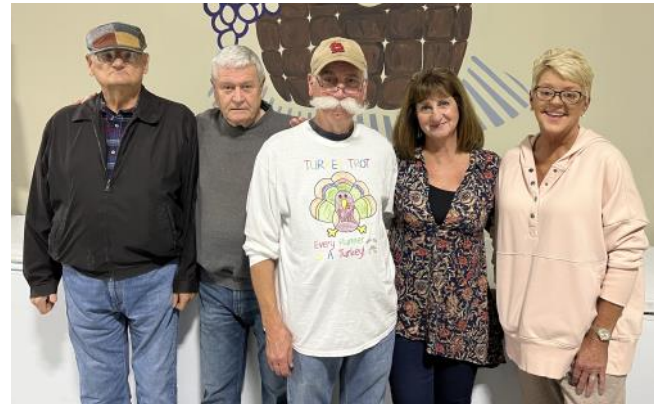
November's Prodigy Pantry Crew