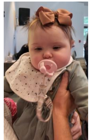
I want Minnie Mouse ears too ...