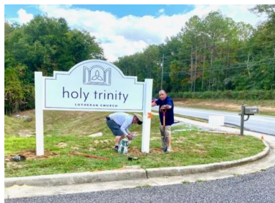
A new sign was installed at the end of October