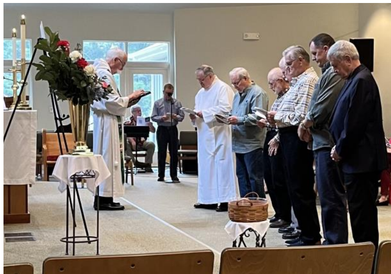
Thanks to our Veterans